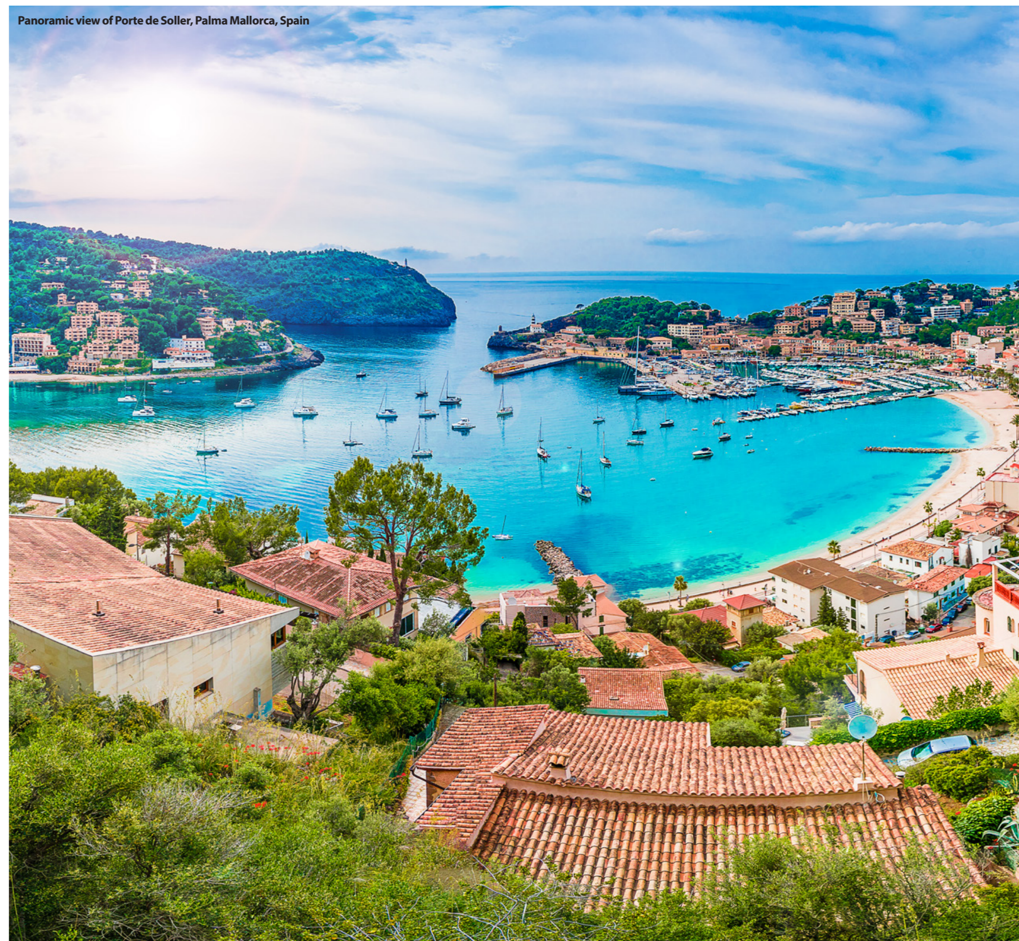
Panoramic view of Porte de Soller, Palma Mallorca, Spain