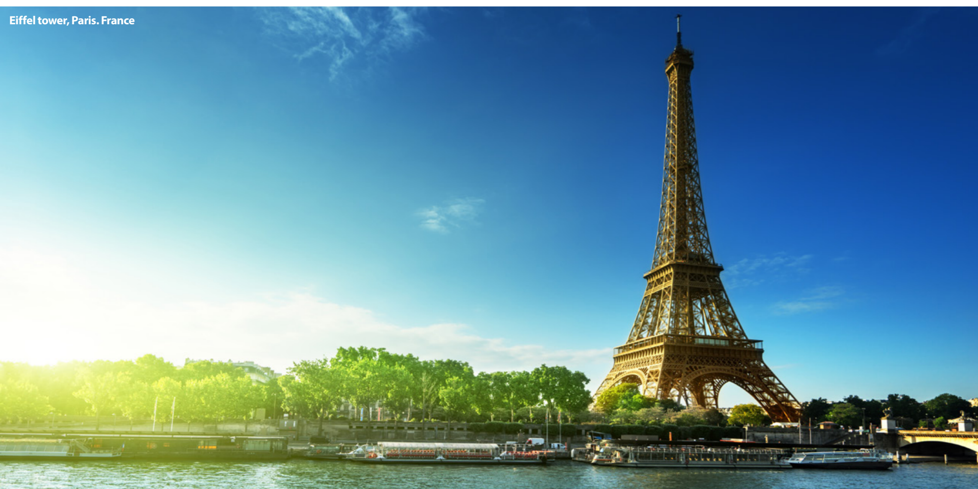
Eiffel tower, Paris, France