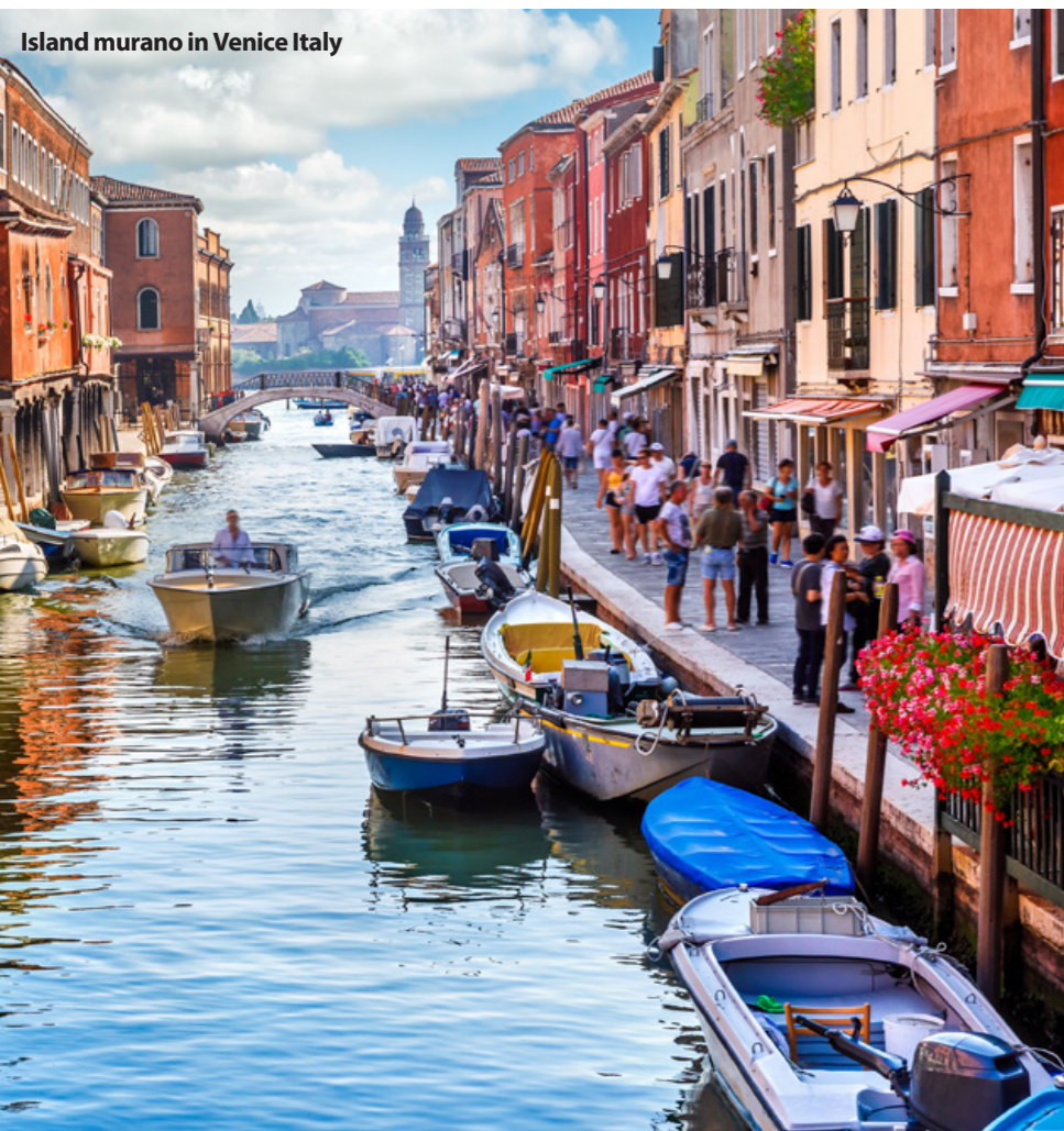
Island murano in Venice Italy